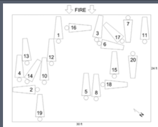
Body positions at the deployment site. Numbers are based on the crew manifest.