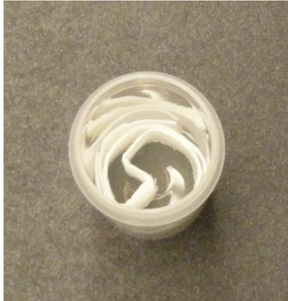
Figure 1. Top view of filter strip rolled and placed in 28mm diameter plastic extraction tube.