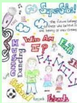
By SuperSib Diana, age 17