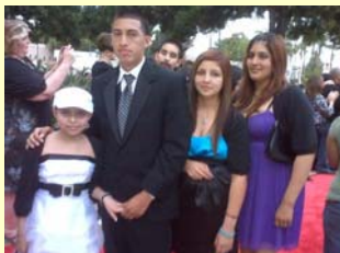
SuperSibs! on the red carpet!