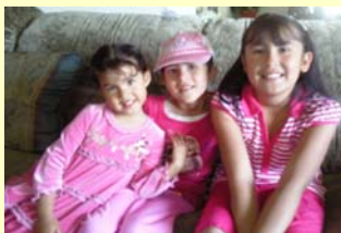
Pretty in Pink!