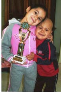
"I love my SuperSib sister"