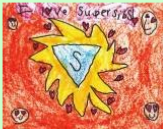
By SuperSib India, age 6