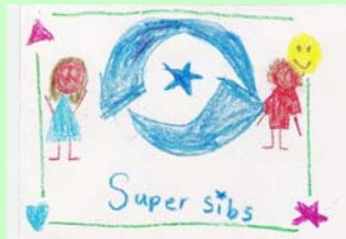
By SuperSib Maya, age 9